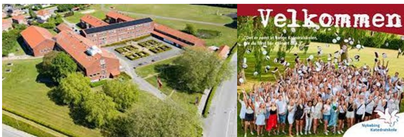
Nykøbing Katedralskole, Nykøbing Falster, Denmark

From June 2021 until June 2022, our school is building a new Sportsarena which will facilitate collaboration and cross curricular learning even more – and include the surroundings as a town hall.